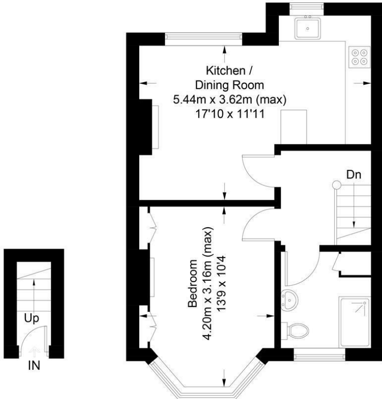
Ground Floor First Floor

This floor plan is for representation purposes only and is not drawn to scale. The Gross Internal Area includes outbuildings shown on the plan. Whilst every attempt has been made to ensure the accuracy of the plan measurements of doors, windows and rooms are approximate only and should be checked before making any decisions reliant upon them. Copyright Bespokeplans.co.uk (ID718521)